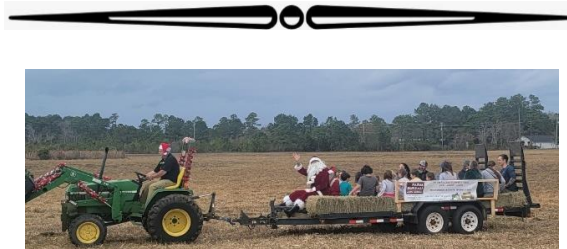
2024 Hayride with Santa – Dec. 7 @ Noon @ Kiwanis Park

December 7, 2024 will be the fourth year for the Coastal Pender Rotary club "Hayride with Santa and Online Auction Event". The proceeds from this fundraiser will support many worthy community projects. Past projects include: food and equipment for Share the Table Food Bank; Astronomy equipment including planetariums for Surf City and Topsail Middle Schools; Dictionaries to every third grader at North Topsail, South Topsail and Topsail Annandale Elementary schools as well as a donation to the Booster Club of Topsail High School for the purchase of a musical equipment trailer.