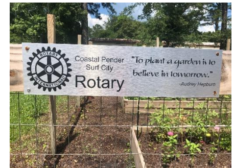
Rotarian created garden at Roots for Recovery

Rotarians providing Service Above Self since 1925 for local and global communities