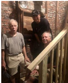
Newly built stairs at Safe Haven